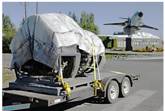
The Wright Cyclone R-3350 departs CFB Comox, heading for its new home in Langley.

The particular engine joining the CMF collection is a Wright R-3350 TC18EA1 Turbo-Compound engine, as fitted to the Canadair CP-107 Argus maritime patrol aircraft in which service it developed 3,700 shp. It is a twin row, 18 cylinder monster displacing 3347 in 3 . Vic, where will it fit?