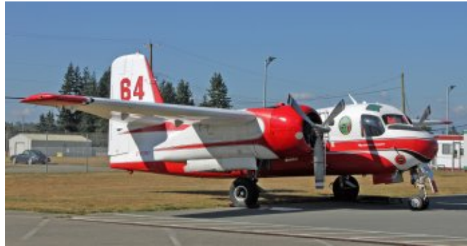
Firecat #64 as she looked at Abbotsford Airport in September, 2012, after her final fire fighting season.