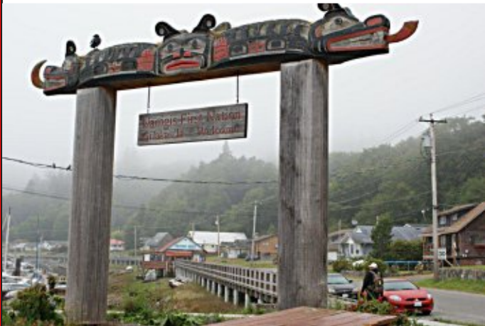
The community of Alert Bay, home of the 'Namgis First Nation.

Sights included the main street of the village, the spot where the old hospital had been located, the boarded-up nurse's residence, the government wharf, and the now dilapidated Residential School. Next, we took in a T'sasala Cultural Group traditional native dance performance in the Big House, a magnificent structure where many traditional native functions are held. After arriving back at the airport, we continued to give tours of the Waco and to hear more great stories from the visitors to our aircraft.