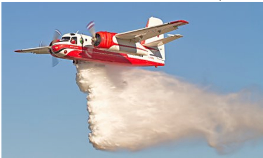
Conair Firecat #64 arrives in style at Langley Airport, strutting her stuff in front of an appreciative audience.

The Firecat started its life as a Canadian built CS2F Tracker aircraft and was flown from the deck of the Royal Canadian Navy's HMCS Bonaventure aircraft carrier in its role as an anti-submarine patrol aircraft. In the 1970s, Conair developed the Firecat by modifying and converting many of these former RCN Trackers into a very successful firefighting machine.