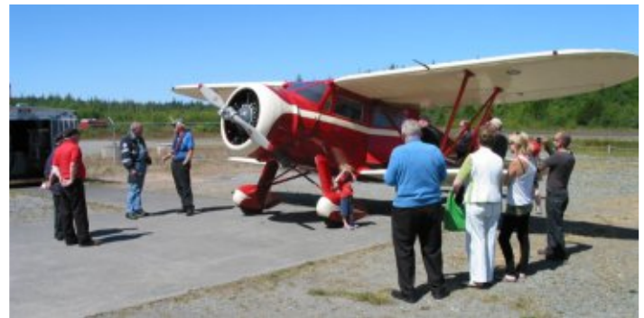
The CMF Waco Cabin drew a crowd of interested residents at Port McNeill airport.