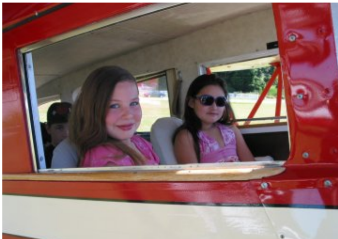
Alert Bay residents, young and old, checked out the Waco Cabin, contemplating "how it was".